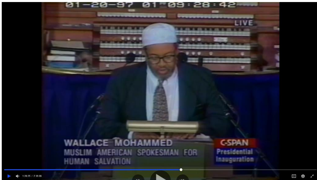
The imam presenting remarks during Clinton's 1997 Inaugural Interfaith Prayer Service.