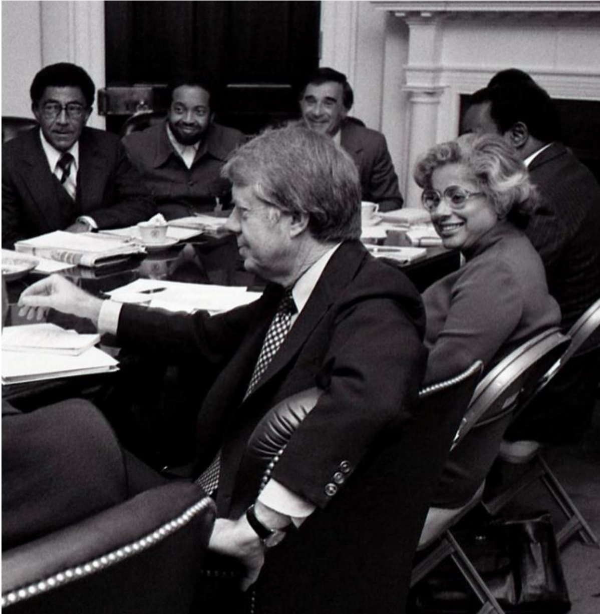
On December 14, 1977, Imam Mohammed, seated next to Rev. Joseph E. Lowery, President of the Southern Christian Leadership Conference (SCLC), attended President Carter's meeting with 14 other members of the Black Leadership Forum. Patricia Roberts Harris, Secretary of Housing and Urban Development (HUD) and first Black woman to serve in a cabinet position, is seated next to the president.