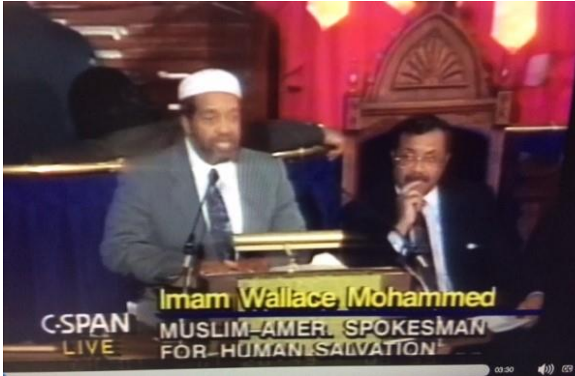
Imam Mohammed speaking at Clinton's 1993 Inaugural Interfaith Prayer Service.